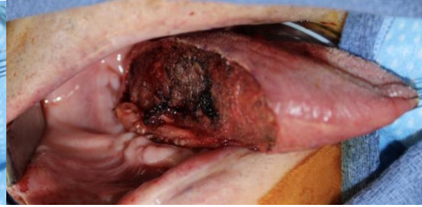
Pic 2: S/p excision