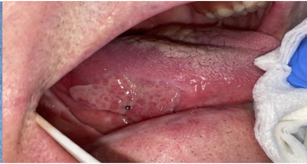
Pic 4: 3 weeks post-op