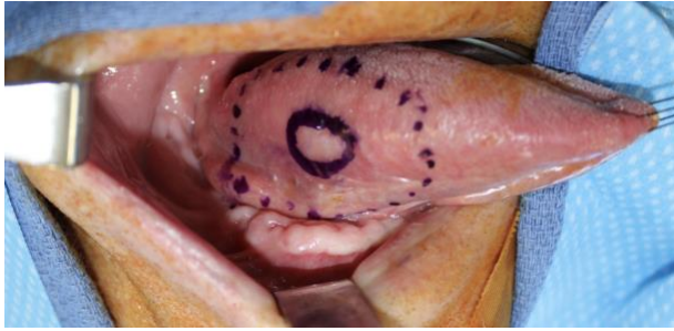
Pic 1: PreOp markings

70 y.o. male patient with T1 squamous cell carcinoma of right tongue underwent wide local excision and application of dermal scaffold that was secured with chromic gut sutures in interrupted fashion with tacking stitches. At his first week follow-up he reported not taking any pain medication after the second postoperative day. At the second follow up, the scaffold was noted to be partially incorporated. Patient reported pain 4-6/10 when eating that was adequately controlled with over-the-counter pain medication. At the third week follow up patient declined needing to take pain medicine and site appeared to be healing well.