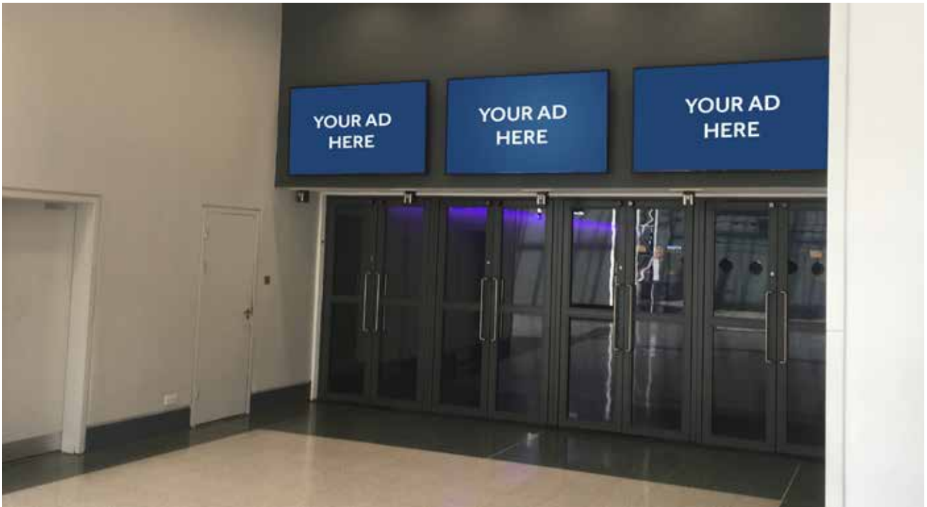
Entrance to Lomond Foyer