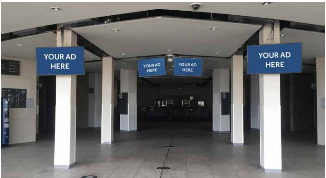
Armadillo Foyer & Forth Room