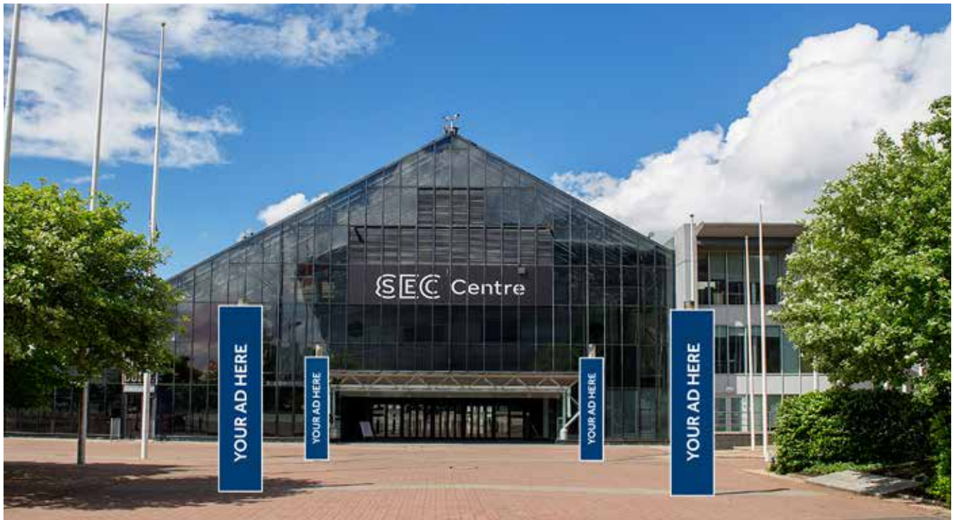
East Entrance TriSigns Lampposts