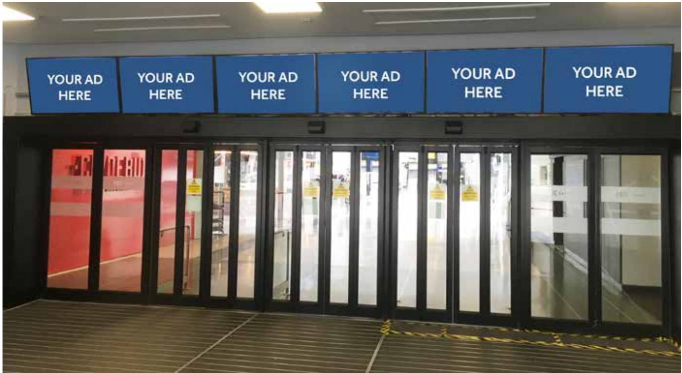
East Entrance Main Doors