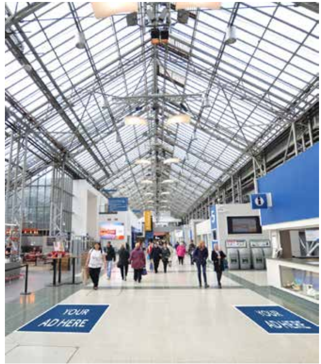
Concourse Floor Vinyl