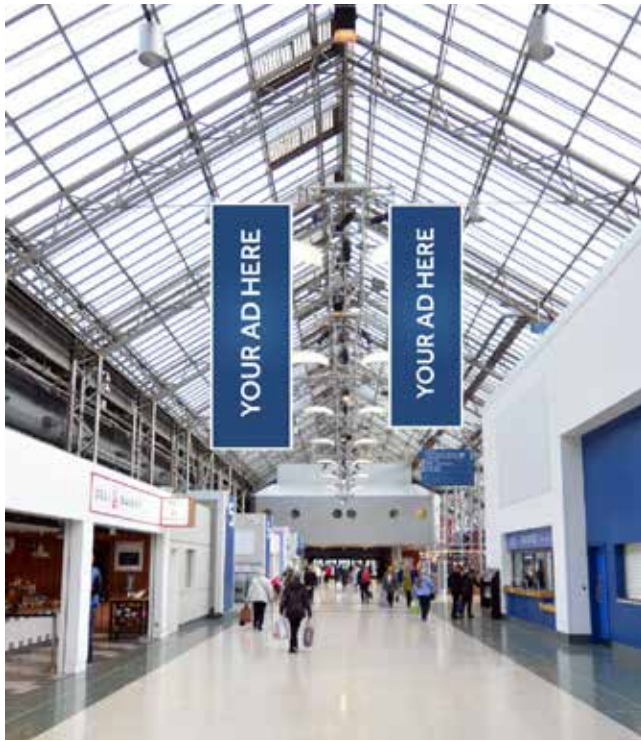
Concourse Hanging Banner