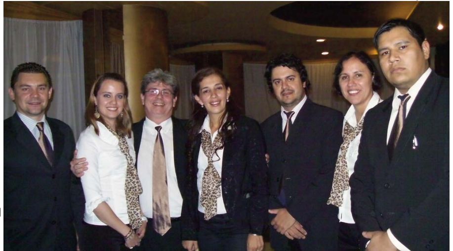
The Organizing Committee, Itapua.