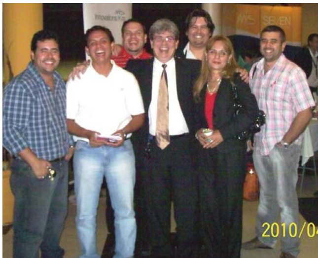
Organizing committee for the SPCBMF

The fifth course takes place on August 26-28, 2010 on the topics of