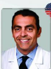
Dr.Tirbod Fattahi President of the Congress